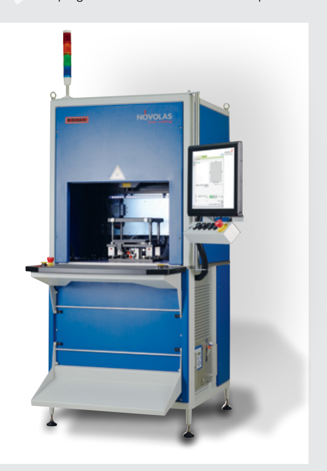
Figure 3: NOVOLAS WS-AT from Leister

An additional challenge is the height of the web in the transparent cover. In the welding plane, this height varies between 4.5 and 6 mm. The width of the web, on the other hand, is a mere 1.1 mm. The ratio of height to width is less than optimal for laser welding. The laser beam must be perfetly coupled into the surface of the transparent partner to give a good weld appearance. Here, the web is illuminated over the whole width by total reflection and the weld seam is therefore also limited in width. If the coupling is too low or too high, the radiation sidewards next to the web can result in burning of the main body. The web of the transparent cover is also positioned by a cavity in the main body. The width of this cavity should also limit the manufacturing tolerances in the injection molding process. Distortion of the individual components in this process is probable because of the three-dimensional form of the light. As the laser beam always follows the same contour, however, distortion of the cover when engaging could give rise to problems. Leister has therefore built additional positioning points into the clamping mechanism. These are responsible