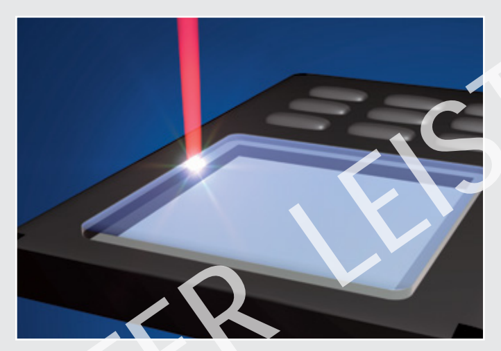
Figure 2: Contour welding process

The joining of the indicator light was originally designed for ultrasonic welding. The melting and associated material flash from the weld in this method does not however give the light an acceptable appearance. The laser welding method was therefore tested as an alternative. As laser transmission welding is still a relatively recent technology, the design requirements for the components are still not widely known. Ejector marks and injection points