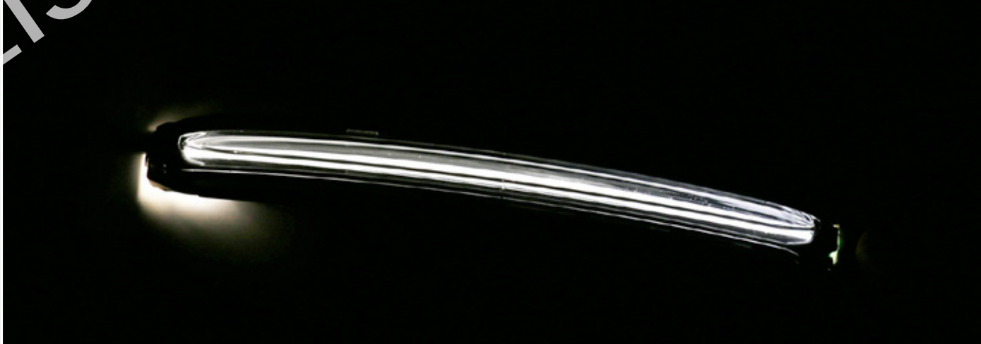
Figure 1: Two-part indicator light from Magna